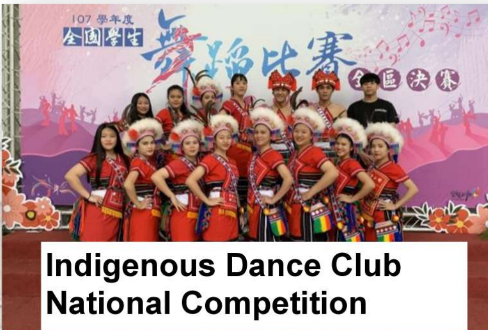
Indigenous Dance Club National Competition