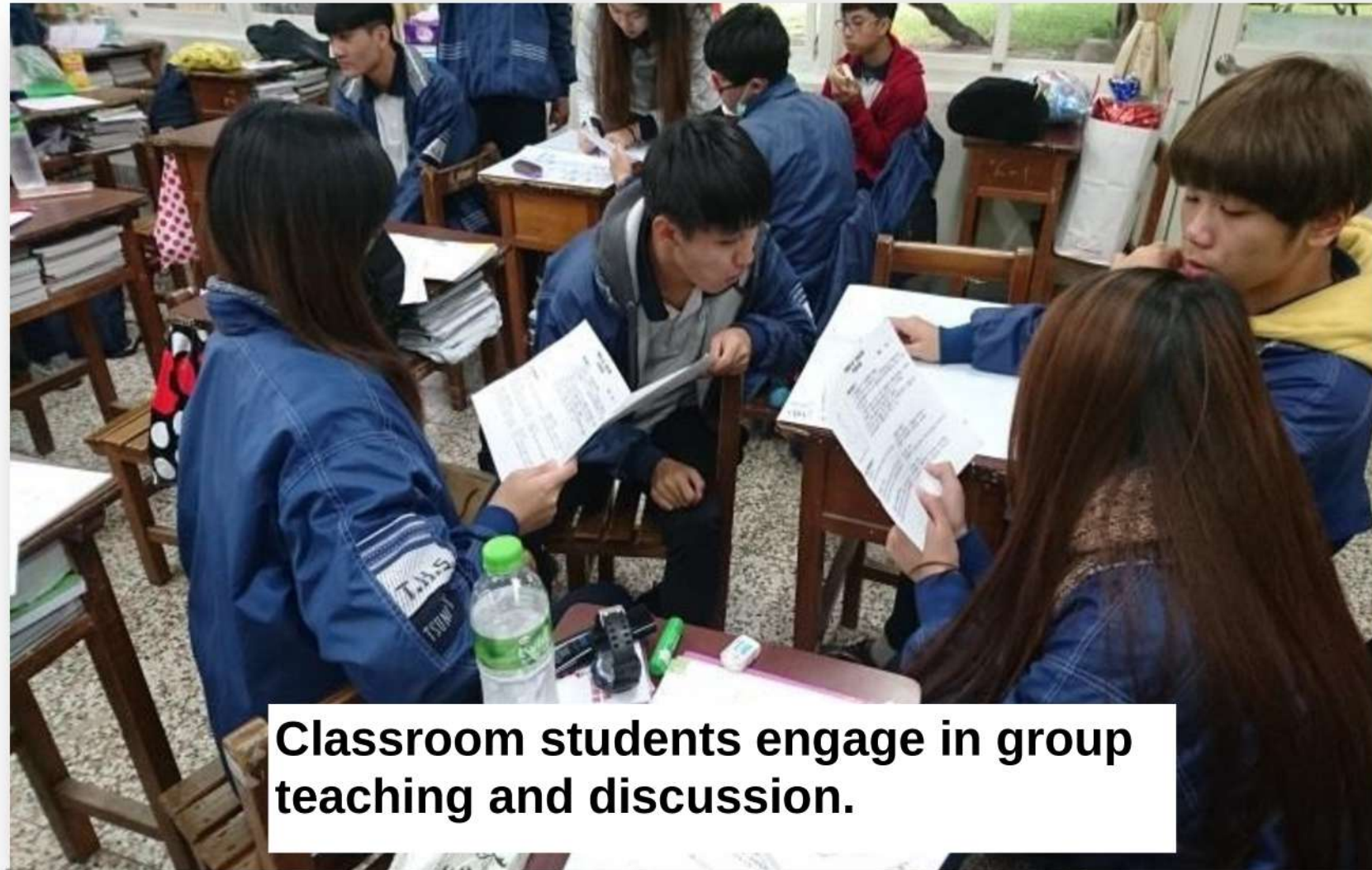
Classroom students engage in group teaching and discussion.

We encourage teachers to implement group teaching and differentiated instruction . Teachers actively provide remedial teaching to support students.