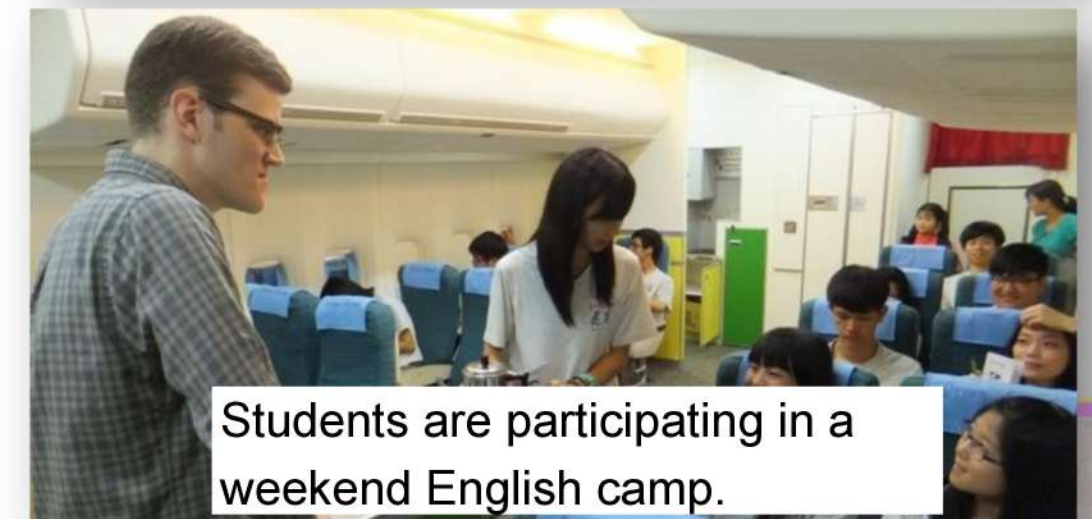
Students are participating in a weekend English camp.