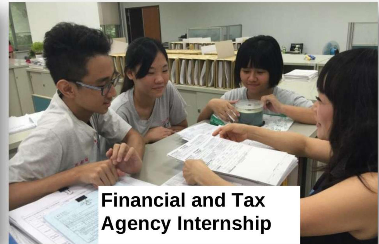
Financial and Tax Agency Internship