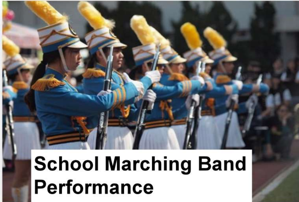
School Marching Band Performance