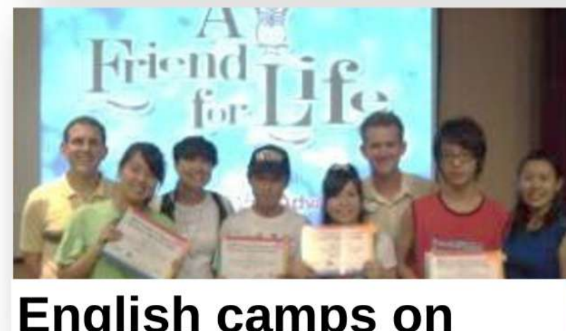
English camps on weekends