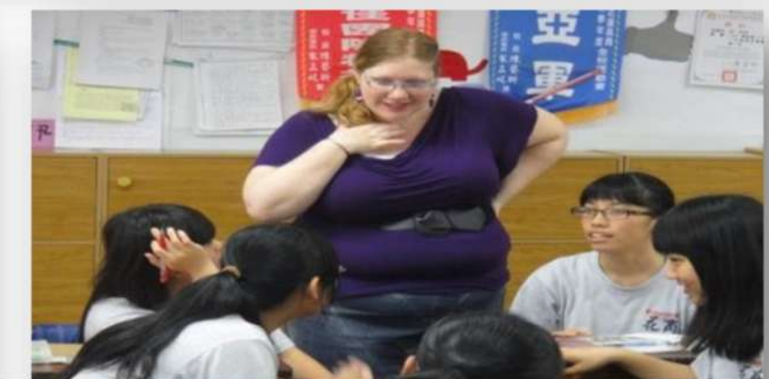
Collaborative teaching with foreign teachers