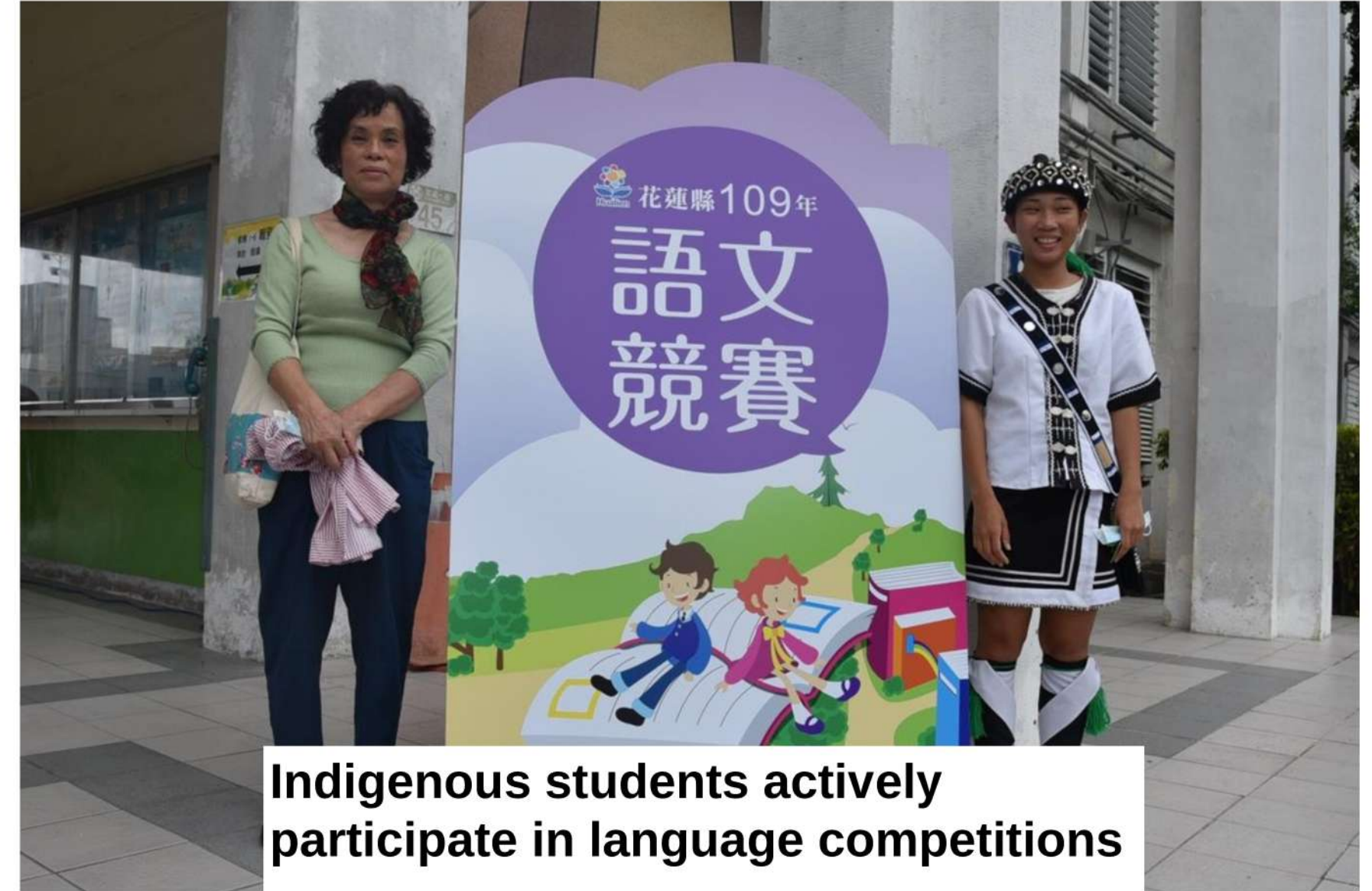
Indigenous students actively participate in language competitions

Cultivates students' systematic thinking and problem-solving skills, with multiple award-winning essays at the national level