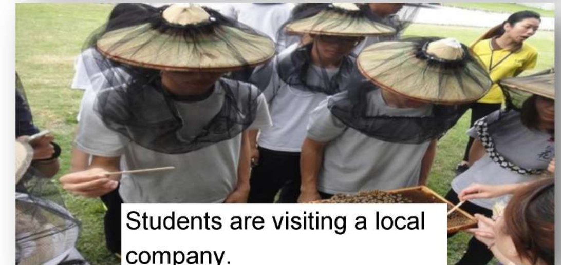
Students are visiting a local company.