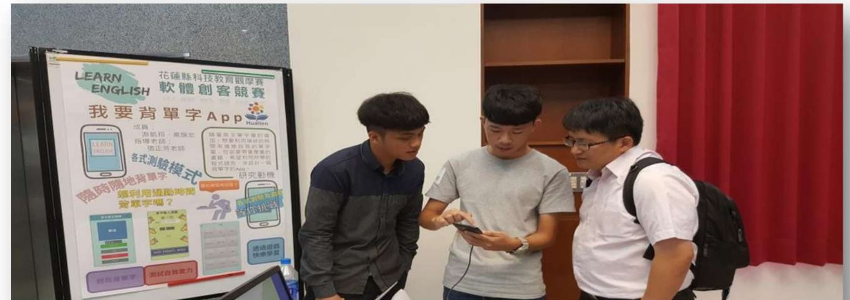
Students' Self-Made Vocabulary Memorization APP