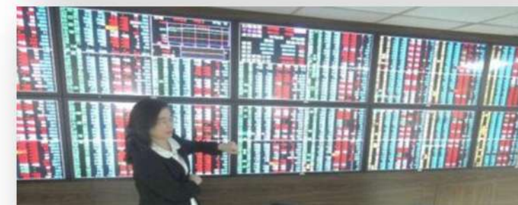
Visits to securities companies