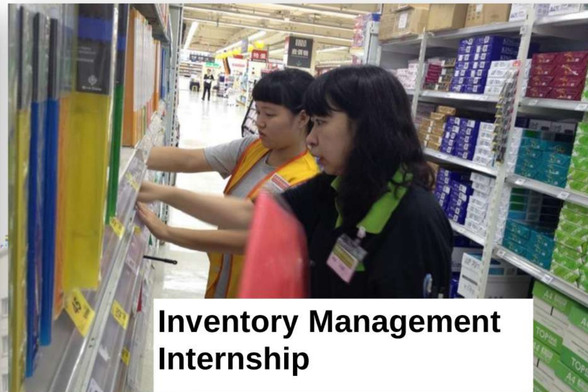
Inventory Management Internship