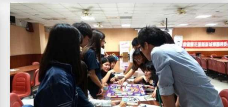
Cash flow practice