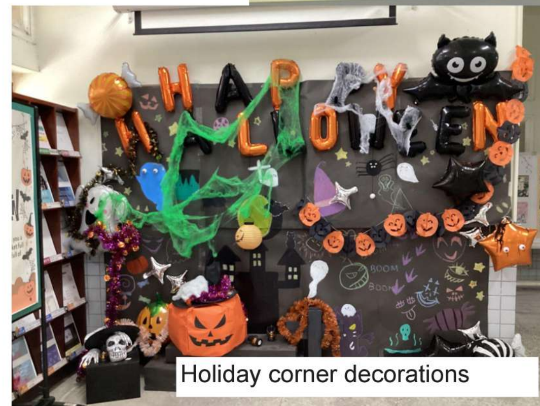
Holiday corner decorations

最終我獲得了金手獎第一名的殊榮，讓我的耕耘得以結下完美的果實，在這幾個月訓練期間我受到了難能可貴的幫助與指導，我的指導老師無條件地給予我最殷切、專業的建議，總是陪伴著我度過每一個階段性的我，與我一起共同進步，是我高中三年間一次珍貴的學習歷程。