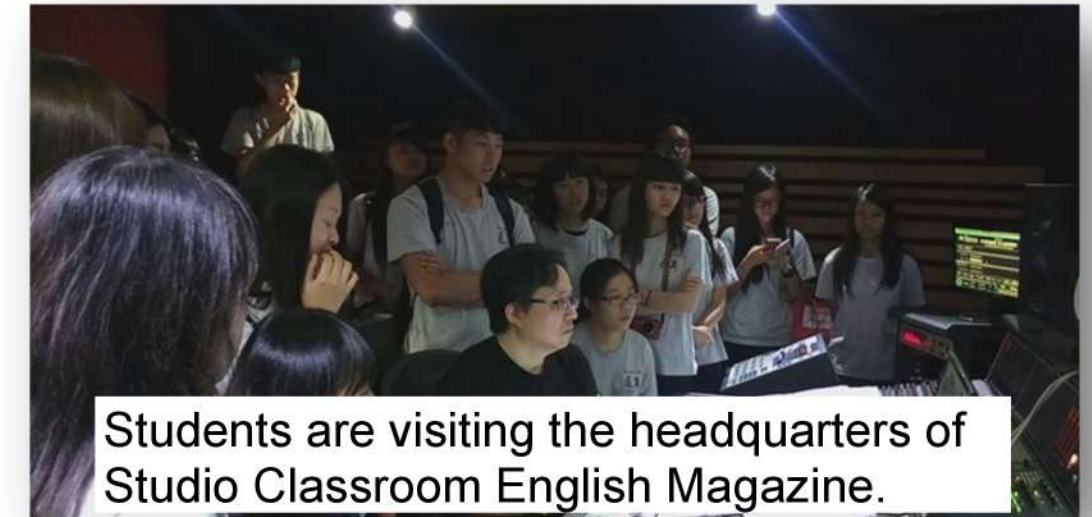
Students are visiting the headquarters of Studio Classroom English Magazine.