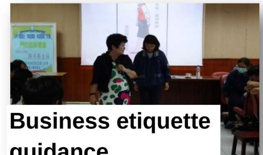
Business etiquette guidance