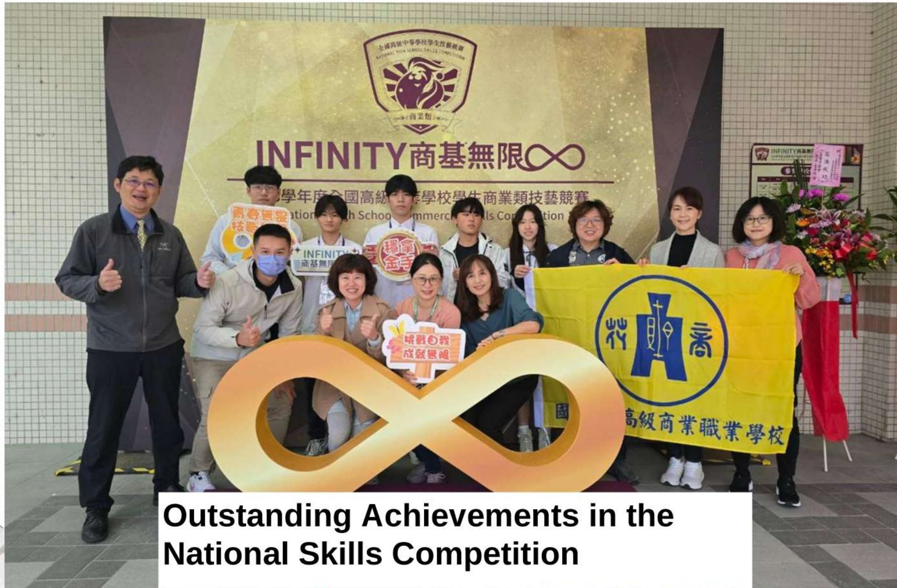
Outstanding Achievements in the National Skills Competition

Our floral design teachers encourage students to improve their technical and professional skills. As a result, our students have successfully obtained Level B certificates .