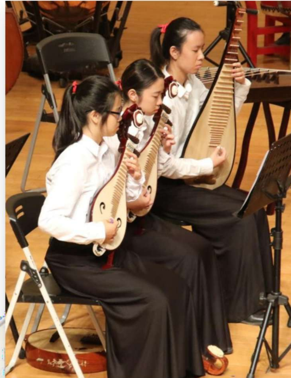
Chinese Music and Brass Band Performance Concert

Encouraging students to participate in a variety of clubs and activities, and to participate in external competitions to cultivate their artistic appreciation and aesthetic literacy.