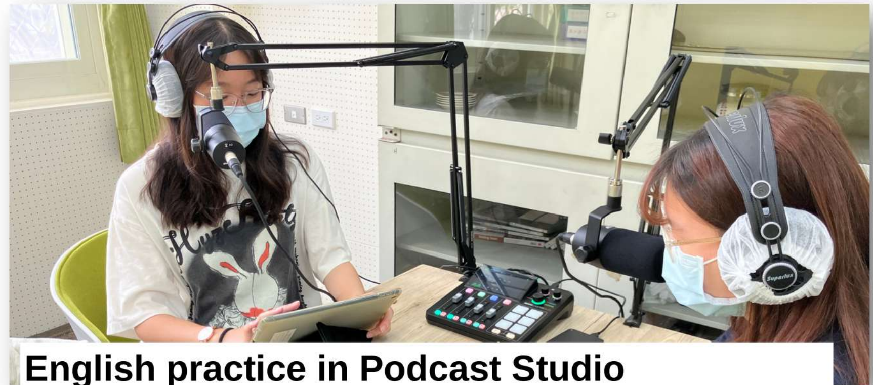
English practice in Podcast Studio