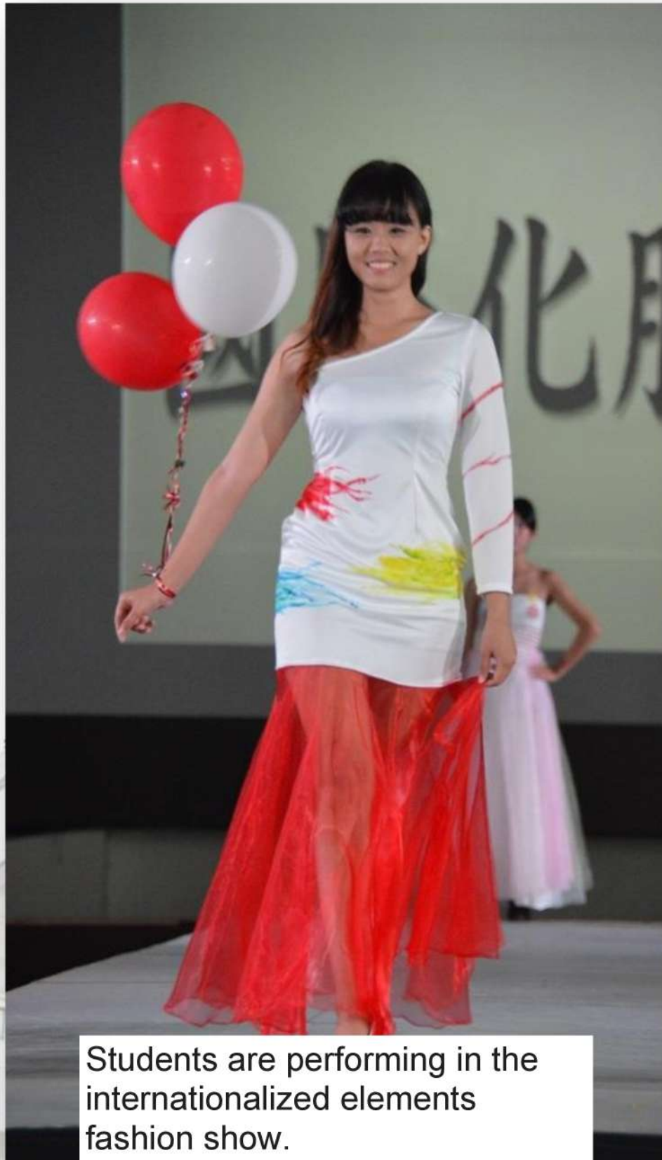
Students are performing in the internationalized elements fashion show.