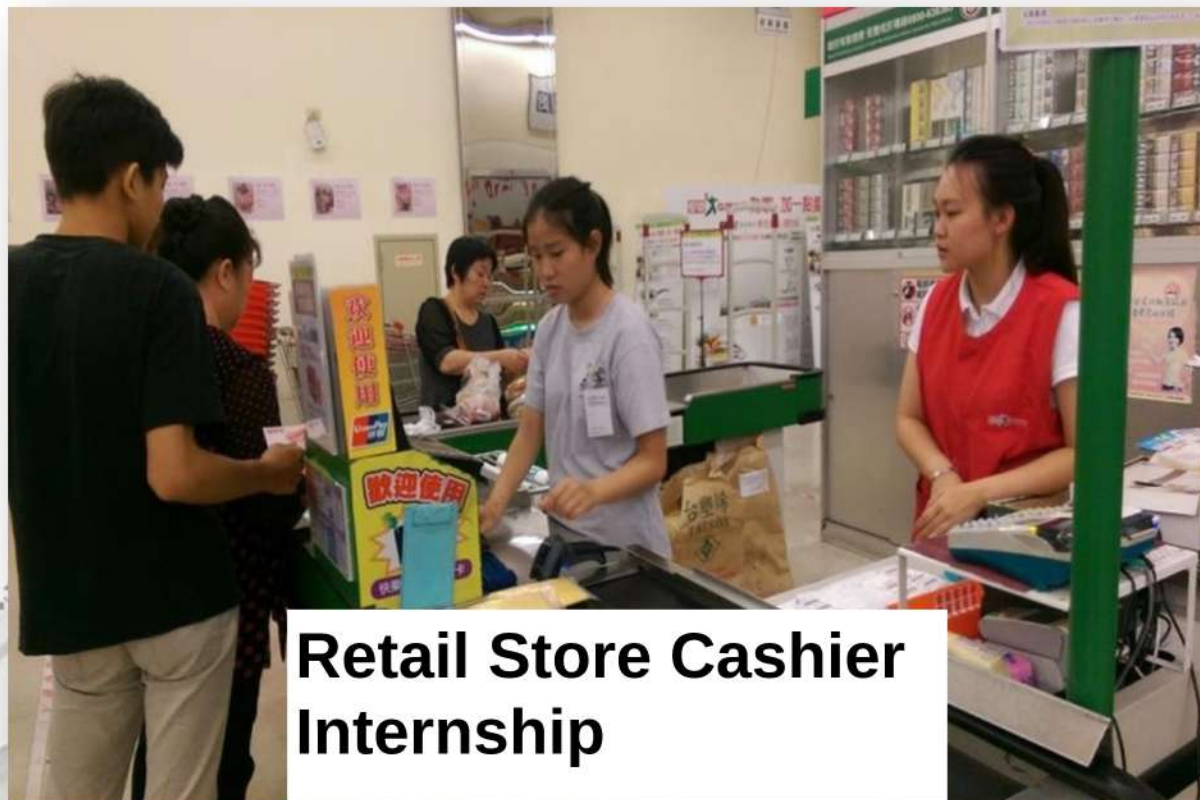
Retail Store Cashier Internship

During the summer vacation, we organize industry internships in collaboration with government agencies and enterprises in Hualien, integrating classroom knowledge with real-life applications