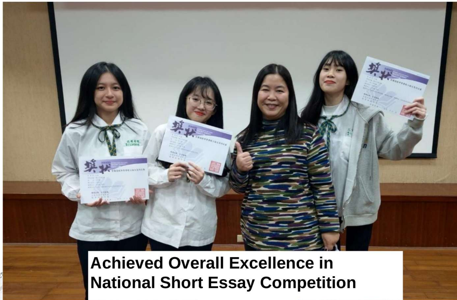
Achieved Overall Excellence in National Short Essay Competition

Cultivates students' systematic thinking and problem-solving skills, with multiple award-winning essays at the national level