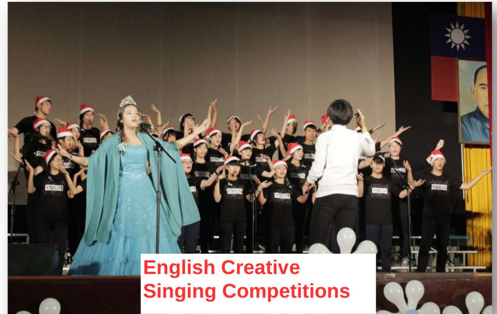
English Creative Singing Competitions

Organize English Creative Singing Competitions and Morning English Broadcasts to enhance students' interest in learning English and their language application skills.