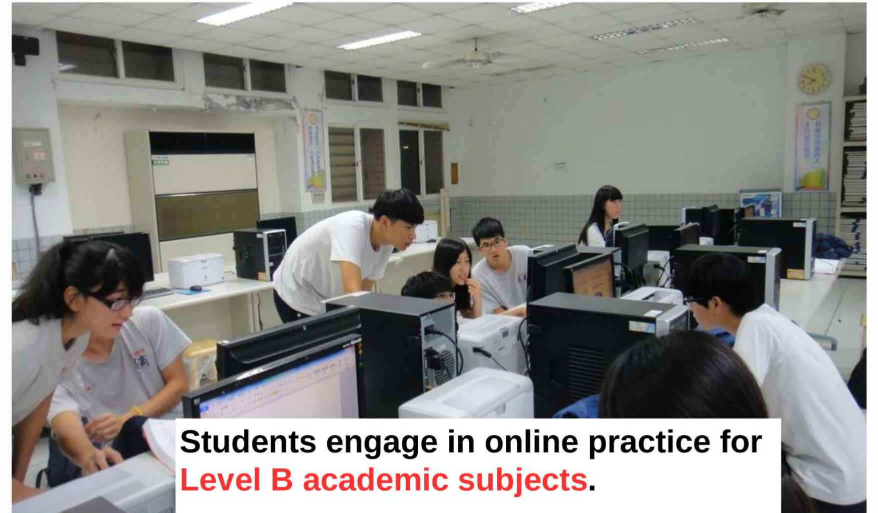
Students engage in online practice for Level B academic subjects .

Each year, we train and select outstanding students to participate in skill competitions, and we have achieved awards every year.